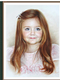
Portrait of child