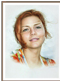
Portrait of girls