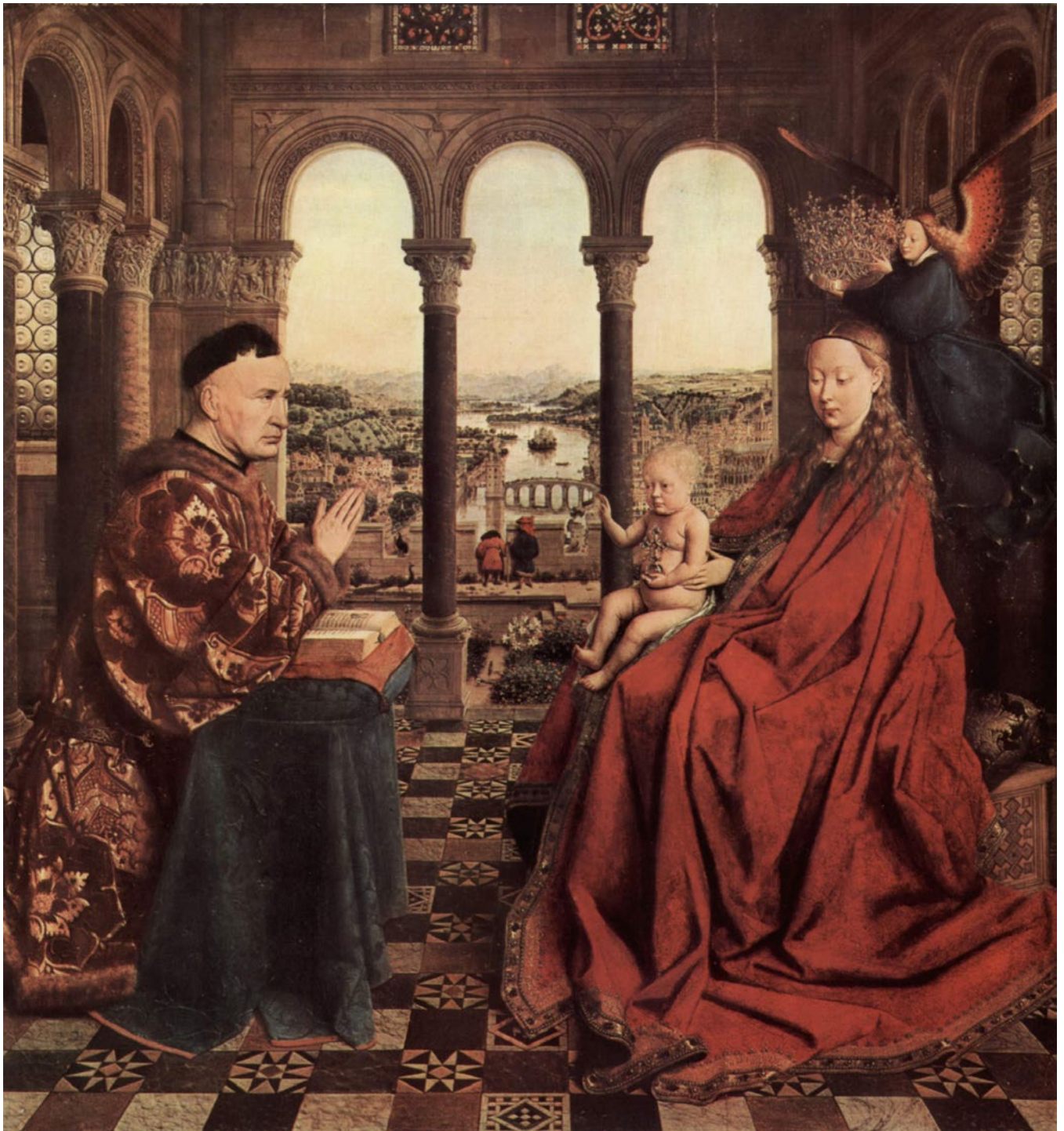
Virgin of the Chancellor Rolin by Jan van Eyck, 1435, oil on wood, 26 x 24. Collection the Musée du Louvre, Paris.