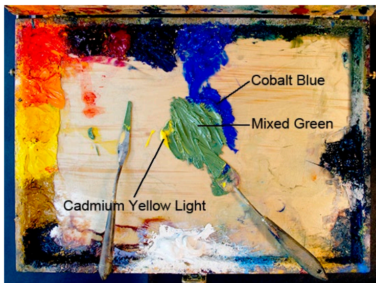
Green secondary mixed from Cad. Yellow Light and Cobalt Blue.

Why mix secondaries when we can easily buy them ready-made? We believe that the only way to truly understand color relationships is to experience mixing them. The confidence and speed you get from knowing which colors will make what mixed tone and how colors affect each other will automatically improve your paintings.