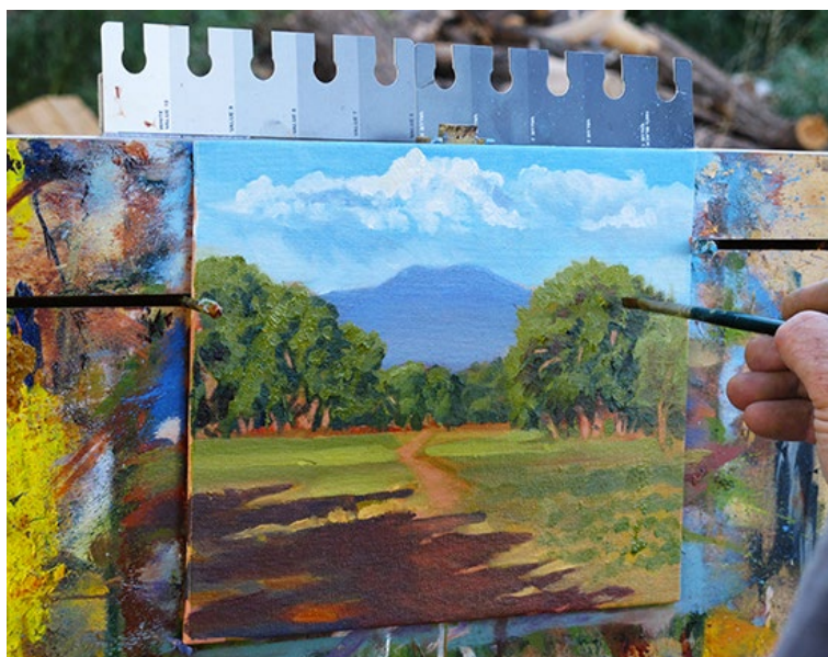
ABOVE Getting the values right with the sight-through grey scale.