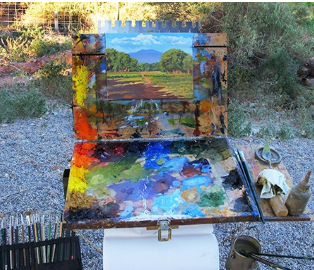
ABOVE My gear and finished study