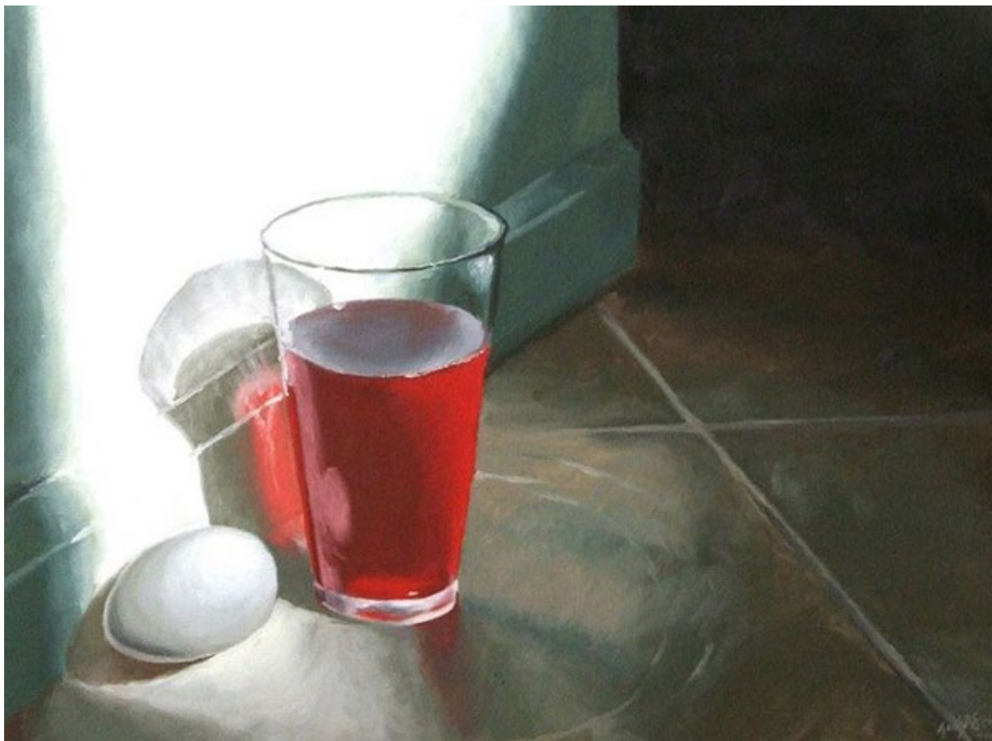
Still Life of Egg and Glass