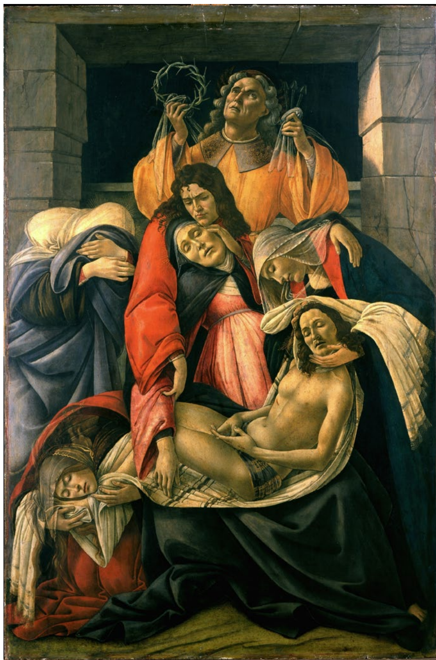
ABOVE Lamentation Over the Dead Christ With the Saints Jerome, Paul, and Peter

When viewing works of art, most viewers see these contrasts at work, but do not know how to identify them. For an artist, knowledge of the basic tenets of color theory can help him or her evoke emotion and leave an impact on the viewer. And just as Itten’s methods can be adopted to yield certain effects, they can also be subverted to shock the viewer and show subject matter in startling ways.