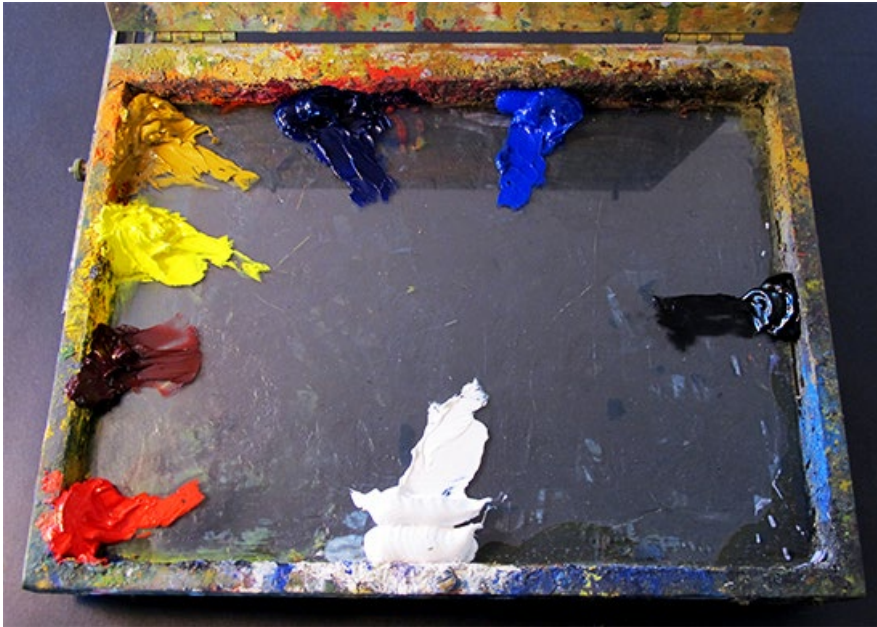
Six Color Prismatic Palette: Cadmium Red Light, Alizarine Crimson, Cadmium Yellow Pale (or Cadmium Yellow Lemon), Cadmium Yellow Medium (or Yellow Ochre), Ultramarine Blue, Cobalt Blue, plus Ivory Black and Titanium White.