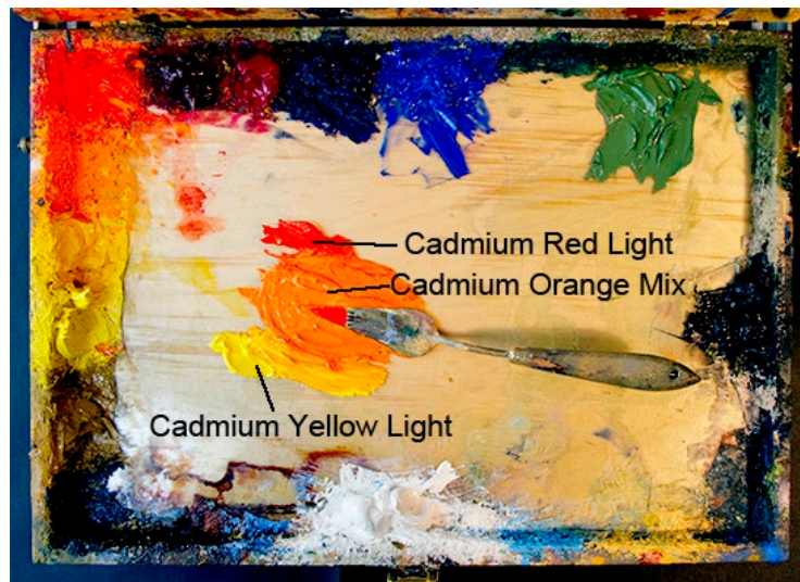
Orange secondary mixed from Cad. Red Light and Cadmium Yellow Light.