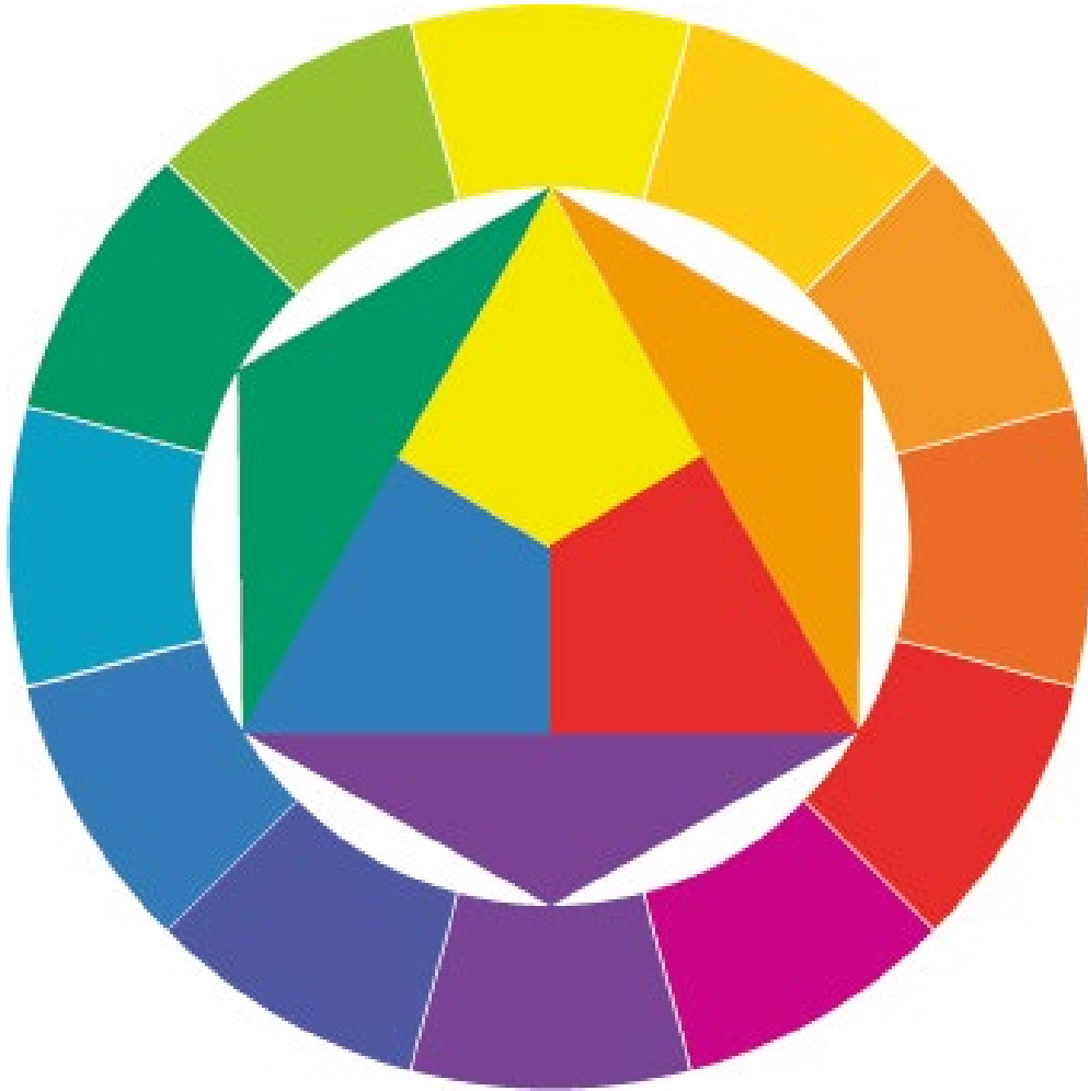
Itten's original color wheel.