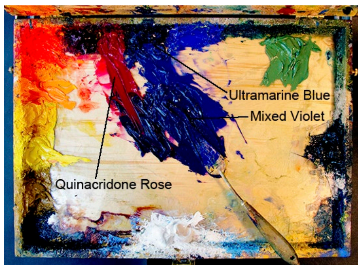
Violet secondary mixed from Quinacridone Rose and Ultramarine Blue. To get a cleaner, brighter violet, I added Quinacridone Rose to my palette.