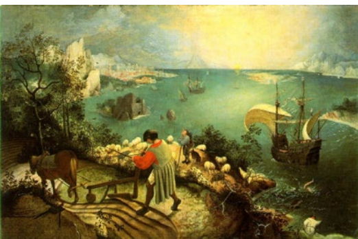
LEFT Landscape with the Fall of Icarus

by Alessandro Botticelli, ca. 1495, tempera on panel, 42 x 28. Collection the Museo Poldi Pezzoli, Milan.